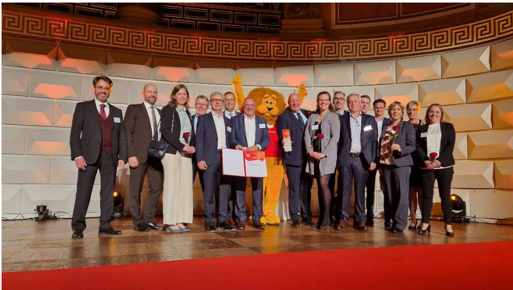
The VAC Team at the 'Hessen-Champions' Award Ceremony